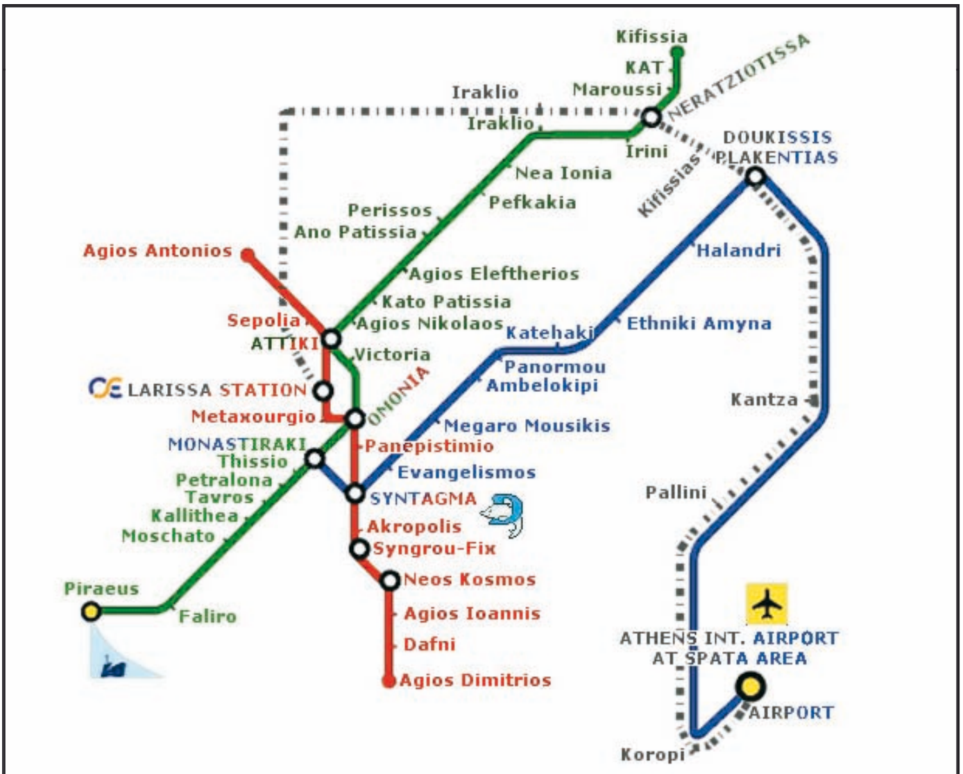
Athens Metro Map